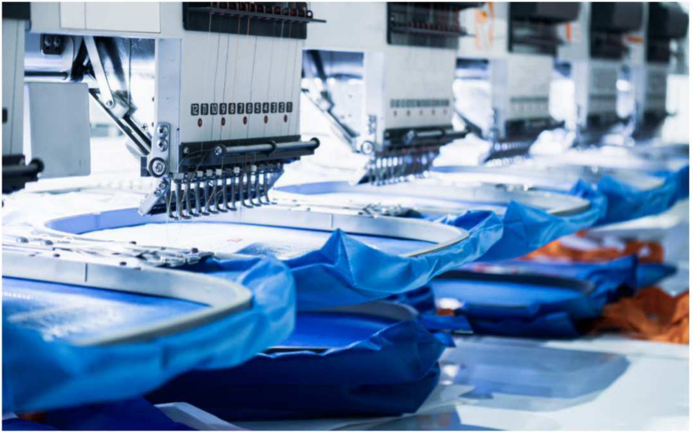
The shrinking workforce raised concerns about the future talent pool and career opportunities in garment & textile industry.