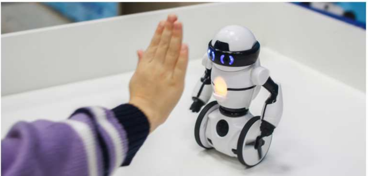
The rising importance of AI and technology will persist as Vietnam’s tech ecosystem grows.

Head of Regional Business Group, PERSOLKELLY Country Head, PERSOLKELLY Vietnam